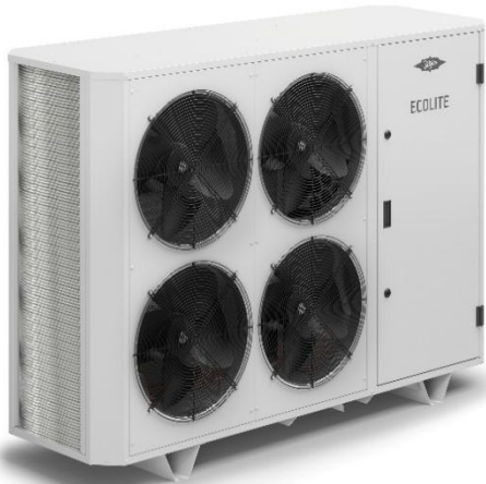
Image 2: The new ECOLITE CO 2 condensing units can be flexibly used for both low- and medium-temperature applications in all climate zones