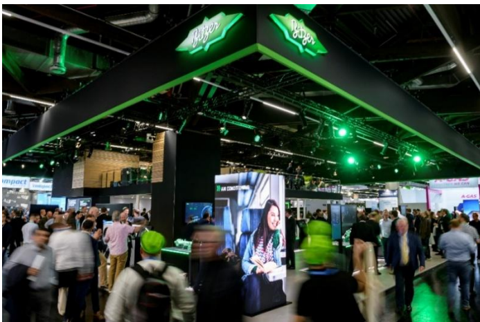
Image 3: At Chillventa 2026, BITZER will present itself with a new stand concept in a new location – directly at the main entrance in Hall 1